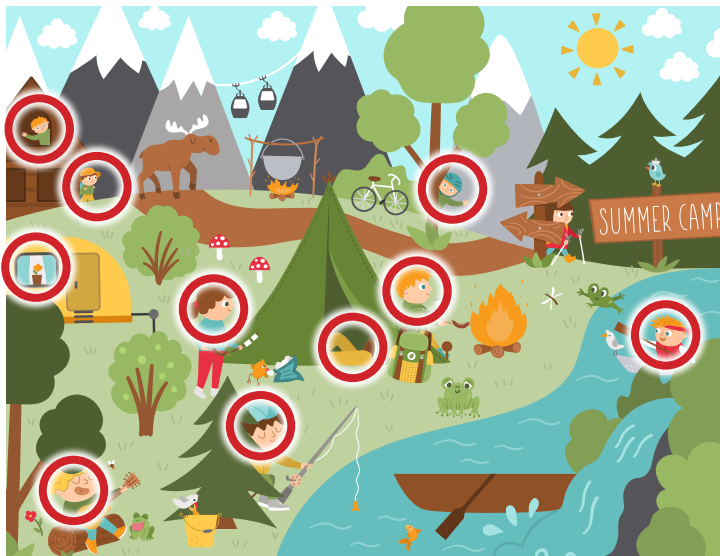
ANSWER KEY FROM PAGE 6